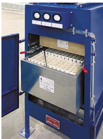
Open door showing separator screen element (bottom), fiberglass ASHRAE box (middle) and HEPA filter (top).

After installation of a Monroe Compact Oil Mist Collector, high production machining areas using water soluble, synthetic or mineral coolants can discharge clean, filtered air back into the work area, reducing system costs.